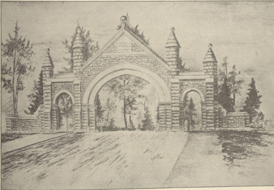
THE EASTON CEMETERY GATEWAY.